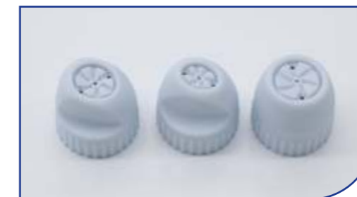
Soft silicone hydro cleaning head