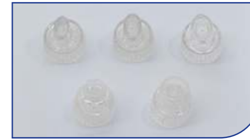
Hard turbine hydro cleaning head

03 Solution are supplied to skin surface through nozzle tip.