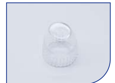
Pipe cleaning head