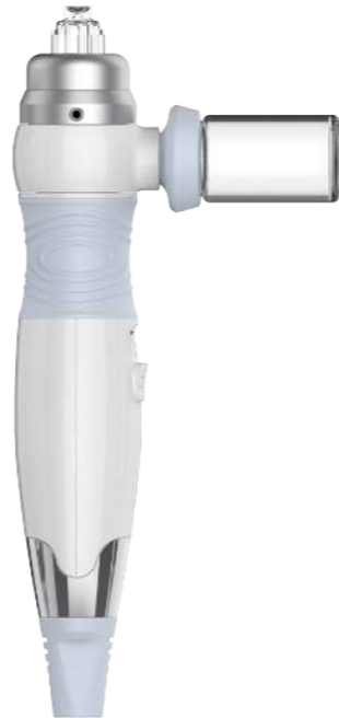
Polymer Atomizing Spray