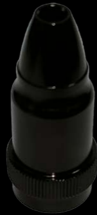
1320nm carbon peel lens

4 kinds of treatment heads, including 532nm, 1064nm, 1320nm carbon peel lens, 755nm fractional lens, comprehensively cover the treatment needs of various treatment projects