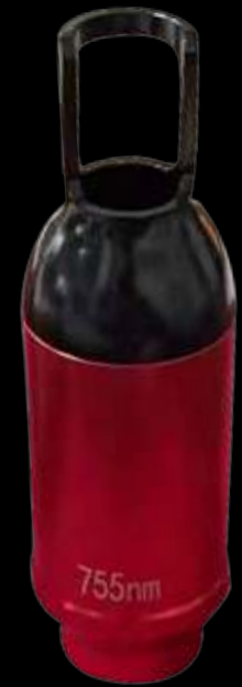
755nm fractional lens (optional)